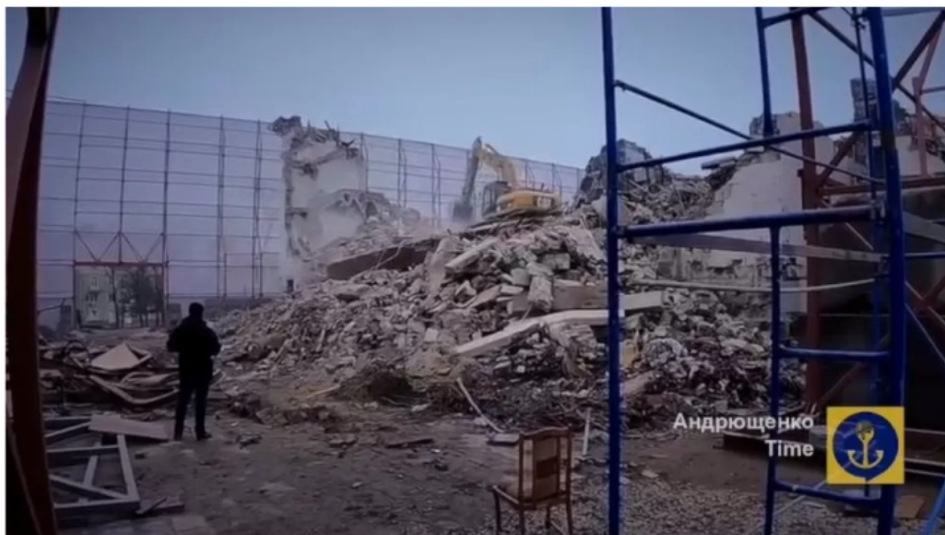
Images of the demolition were posted on social media by an aide to Mariupol's Ukrainian mayor